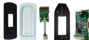
Decorative plate / Shield / TBLOCK / Spacer / Decoder...