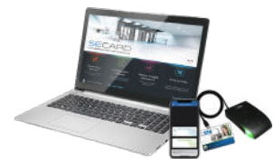
SECARD SECARD configuration kit and SSCP® v1 & v2 and OSDP™ v1 & v2 protocols