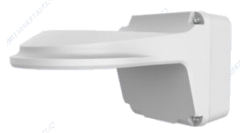
TR-SE24-IN Pendant Mount