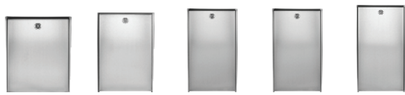
Portra-SS-8x10-E Portra-SS-8x12-E Portra-SS-8x14-45E Portra-SS-8x14-E Portra-SS-8x16-E