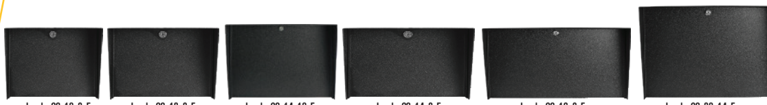
Lando-CS-10x8-E Lando-CS-12x8-E Lando-CS-14x10-E Lando-CS-14x8-E Lando-CS-16x8-E Lando-CS-20x14-E