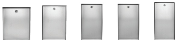
Portra-SS-8x10-E Portra-SS-8x12-E Portra-SS-8x14-45E Portra-SS-8x14-E Portra-SS-8x16-E