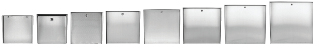
MC-SS-06-E MC-SS-08-E MC-SS-10-E MC-SS-12-E MC-SS-14-E MC-SS-16-E MC-SS-20-E MC-SS-24-E