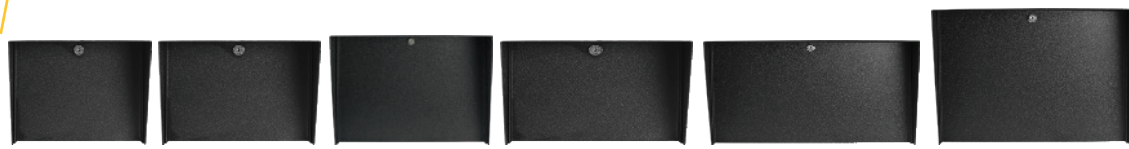
Lando-CS-10x8-E Lando-CS-12x8-E Lando-CS-14x10-E Lando-CS-14x8-E Lando-CS-16x8-E Lando-CS-20x14-E