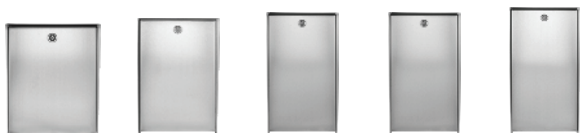
Portra-SS-8x10-E Portra-SS-8x12-E Portra-SS-8x14-45E Portra-SS-8x14-E Portra-SS-8x16-E