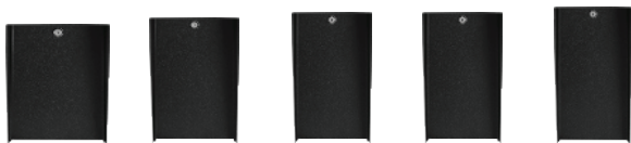
Portra-CS-8x10-E Portra-CS-8x12-E Portra-CS-8x14-45E Portra-CS-8x14-E Portra-CS-8x16-E