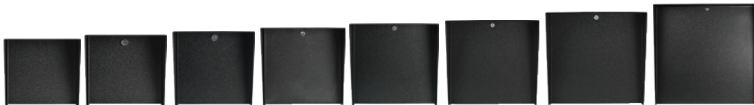
MC-CS-06-E MC-CS-08-E MC-CS-10-E MC-CS-12-E MC-CS-14-E MC-CS-16-E MC-CS-20-E MC-CS-24-E