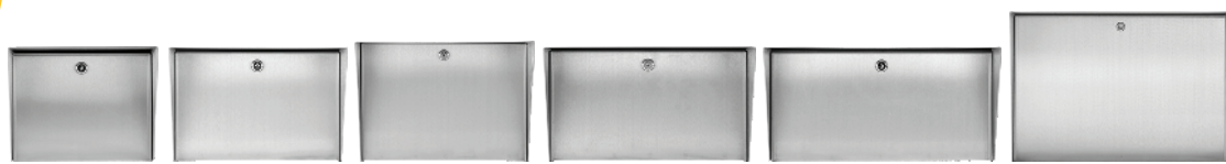
Lando-SS-10x8-E Lando-SS-12x8-E Lando-SS-14x10-E Lando-SS-14x8-E Lando-SS-16x8-E Lando-SS-20x14-E