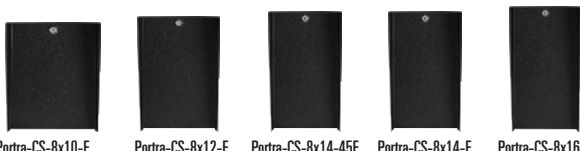
Portra-CS-8x10-E Portra-CS-8x12-E Portra-CS-8x14-45E Portra-CS-8x14-E Portra-CS-8x16-E