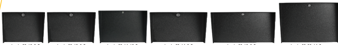
Lando-CS-10x8-E Lando-CS-12x8-E Lando-CS-14x10-E Lando-CS-14x8-E Lando-CS-16x8-E Lando-CS-20x14-E