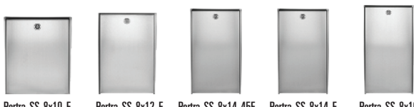
Portra-SS-8x10-E Portra-SS-8x12-E Portra-SS-8x14-45E Portra-SS-8x14-E Portra-SS-8x16-E