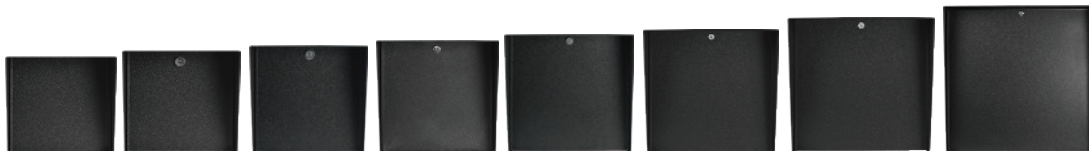
MC-CS-06-E MC-CS-08-E MC-CS-10-E MC-CS-12-E MC-CS-14-E MC-CS-16-E MC-CS-20-E MC-CS-24-E