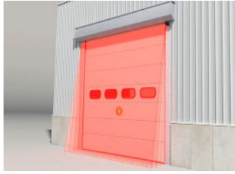
Automatic Industrial Doors