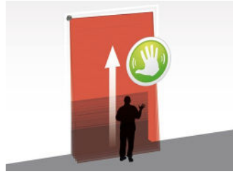
Virtual Push Plate