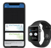
NFC and Bluetooth® Smartphones / connected watches with STid Mobile ID® application