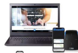
STid Mobile ID Online Portal Web platform for remote management of your virtual cards

* Our readers only read the / UID PICO1444-3B serial number of the iCLASS™ chip. They do not read the cryptographic protections iCLASS™ nor the / UID PICO 15693 serial number of HID Global.