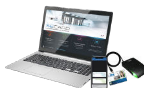
SECard SECard configuration kit and SSCP® v1 & v2 and OSDPT™ v1 & v2 protocols