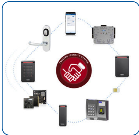
Secure Identity Object Assured Ecosystem